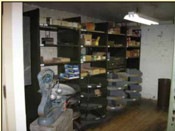
Rotating Storage Bins