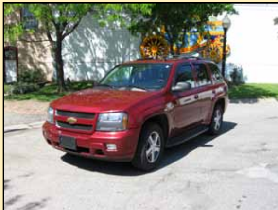
2007 Chevrolet Trailblazer LT