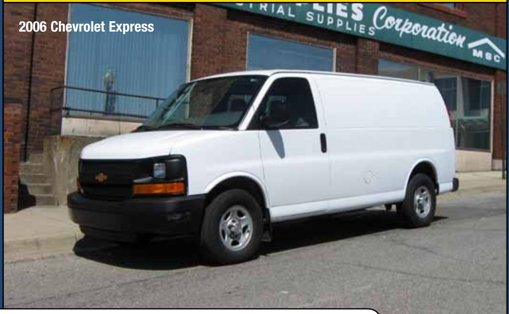
2006 Chevrolet Express

This is your opportunity to pick up additional equipment for your operation. If you are looking for industrial products & production tools, heavy duty metal shelving, office equipment, trucks, industrial forklift plus 100s and 100s of this and that, DON'T MISS THIS SALE!