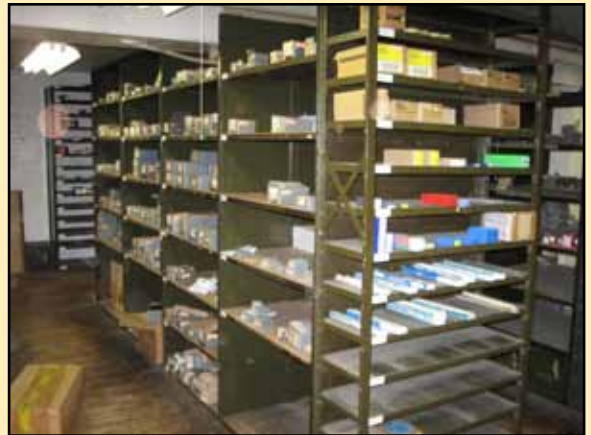
Double-Single Storage Shelves