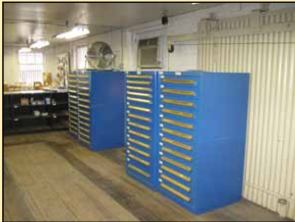
Equipto Sliding Drawer Cabinets