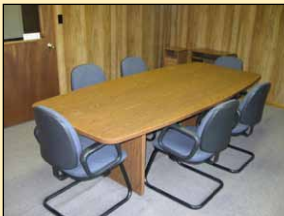
Conference Table with Chairs