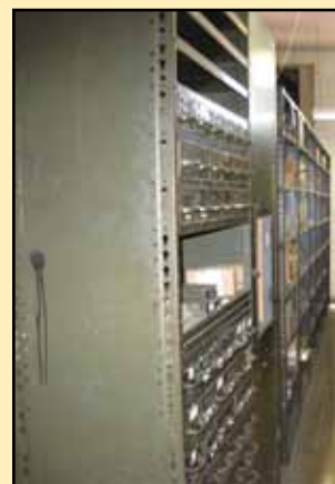
Heavy Duty Storage