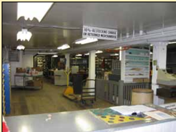
1,000s of Tools