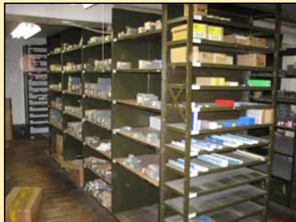
Double-Single Storage Shelves