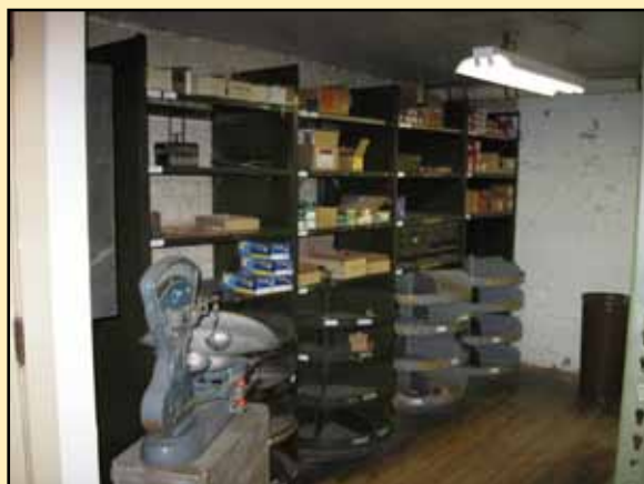
Rotating Storage Bins