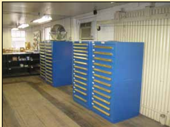
Equipto Sliding Drawer Cabinets