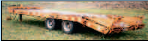
2002 Custom 20T252ADLP (20 Ton)

METABO SBE750 1/2" HAMMER DRILL WITH CASE DEWALT DC988 CORDLESS 1/2" HAMMER DRILL WITH CASE