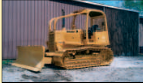
1997 DRESSER TD8H LGP