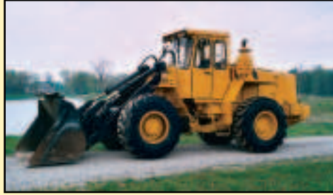
Michigan/Volvo VME L90