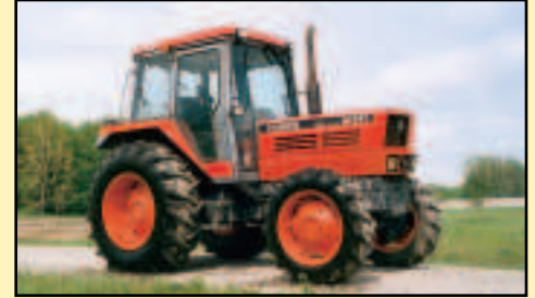
Kobota M6950 4x4