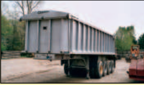
Raven 28' Q/A