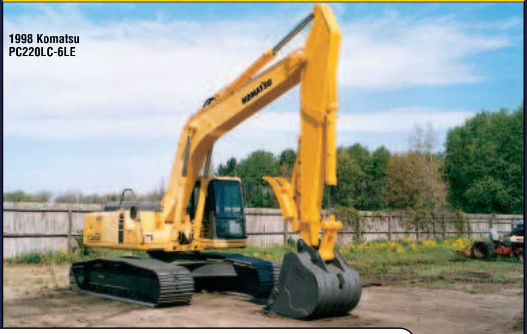
1998 Komatsu PC220LC-6LE

"SERVING THE TRUCKING & HEAVY EQUIPMENT INDUSTRIES" CRANES • CRAWLERS • TRUCK TRACTORS • PICKUPS & SUPPORT EQUIPMENT • TRAILERS