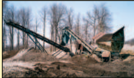
Powerscreen Mark I 24x40 Portable Screening Plant

JOHN DEERE 2640 UTILITY TRACTOR s/n 2613891, c/w OROPS, 4x2 Trans, J.D. 146 Front Loader, 3 Pt. Hitch, PTO, Hyds to Rear, Aux Valve, 9.5Lx15 - 16.9c28 Tires