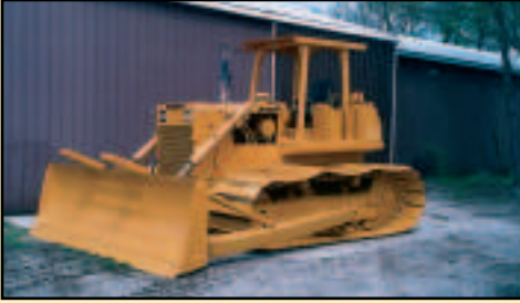
Dresser TD15E LGP