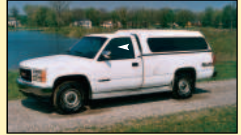
1994 GMC G2500 Sierra 4x4