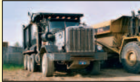
Autocar DK64 TRI/A