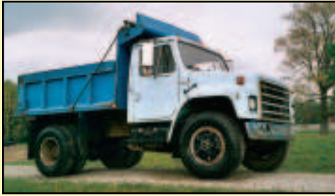
IHC 1824 S/A