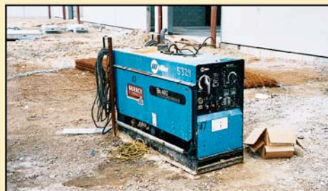
Miller Big Welder/Generator Sets

RAPISTAN F4-15-16-3/4 POWER BELT CONVEYOR , c/w 17"x16" Chain Drive Belt, 36" Folding End, 3/4 HP 115V 1PH Electric Motor