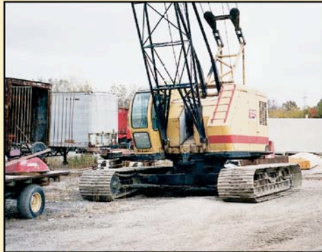
P&H 550 (50-Ton)