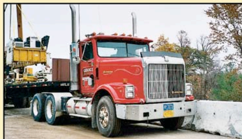
IHC 9300 T/A