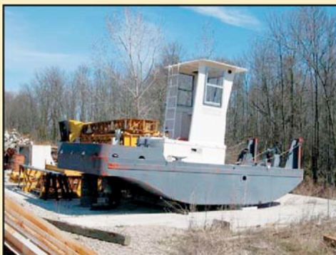
2001 Marine Inland 8x20