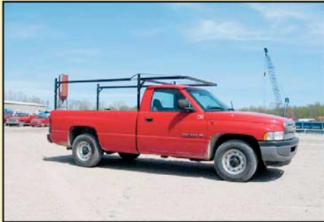
1 of 2 Dodge Ram 1500s