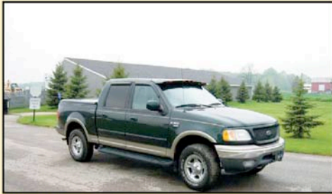
2001 Ford F150 4x4