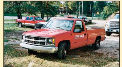
1 of 4 Chevy C1500s