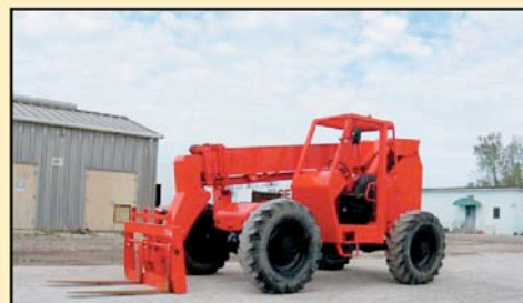
1 of 6 Telescopic Forklifts