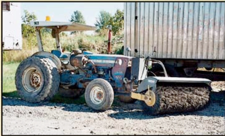
Ford 2000 Utility