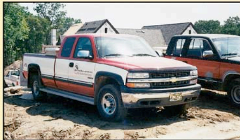
1 of 14 Pickups