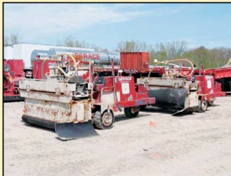
1 of 2 NLB 4400 Robots