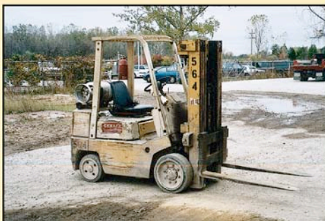
Nissan CPF02A25V LGP