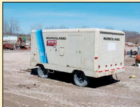
Ingersoll-Rand 750 CFM