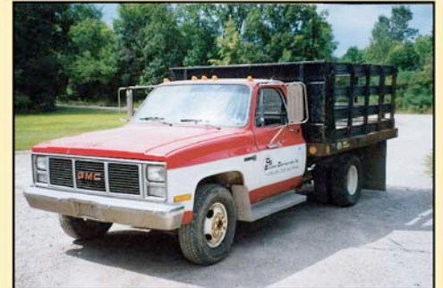
GMC C3500 Sierra S/A