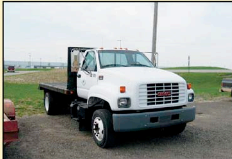
1999 GMC C6500