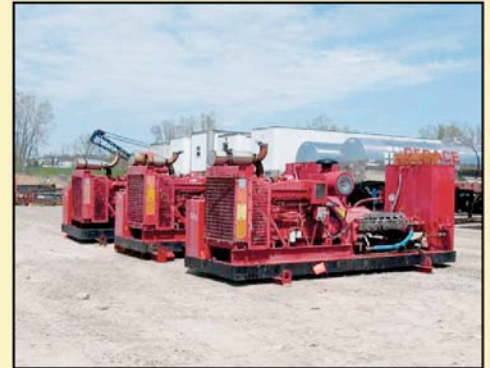
3 of 4 NLB 20256D 20K PSI Pumps