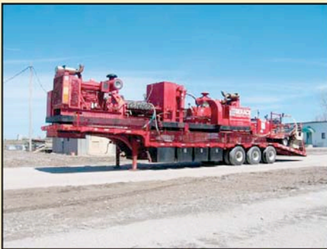
NLB 20250D 20K High Pressure Pumps