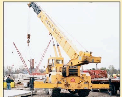
Grove RT755 4x4