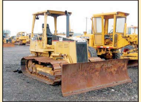
CAT D5C LGP III