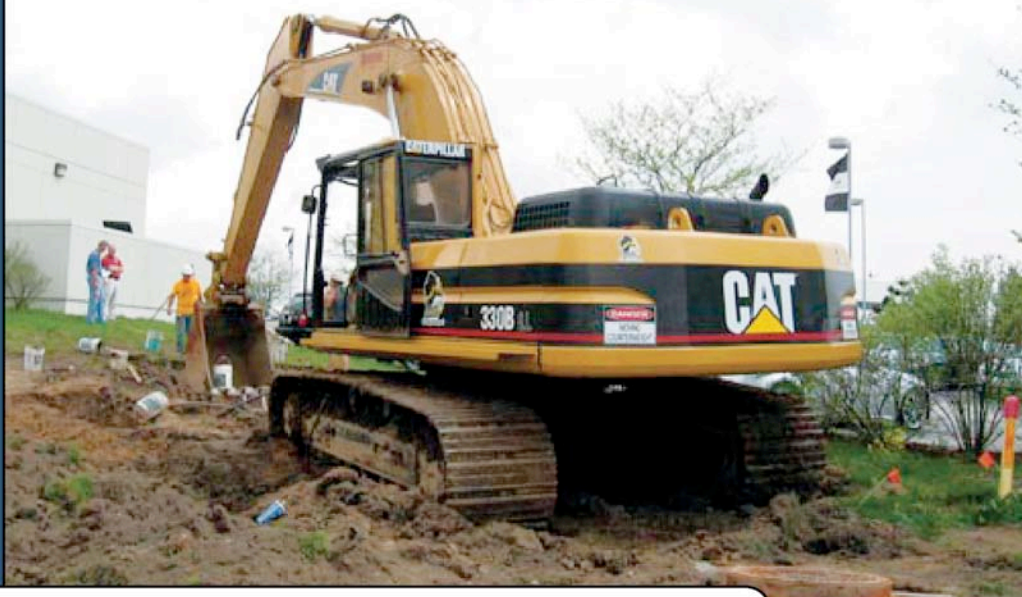
1998 Cat 330BL