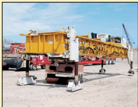
2000 Gomaco C450