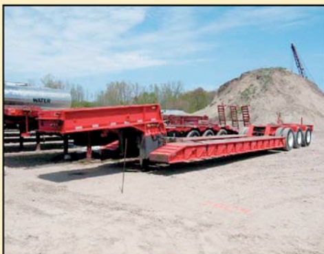
Value PM503ARB 50 Ton