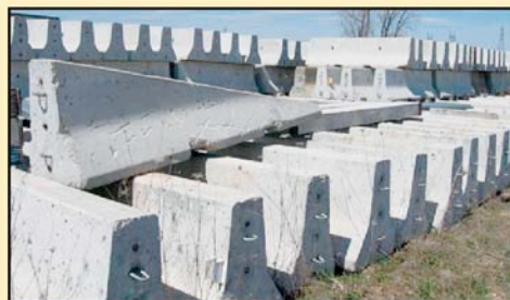
10' Temporary Barrier Wall

EFCO A6 FORM CLEANING MACHINE , c/w Wisc 2 Cyl Engine, 30x96" Feed Belt