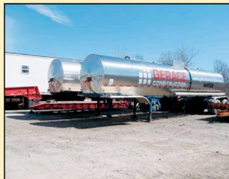
1 of 2 6300 Gal Water Tankers