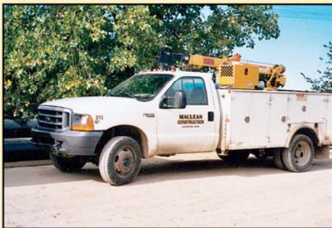
1999 Ford F550 Super Duty S/A 4x4