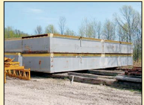
2 of 8 10x40x4 Sectional Barges