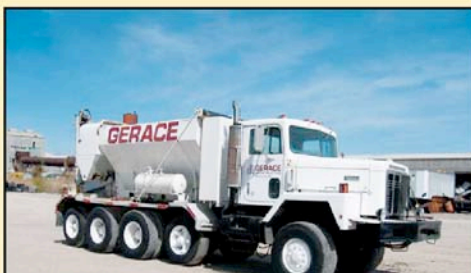
1 of 2 Concrete Mixer Trucks