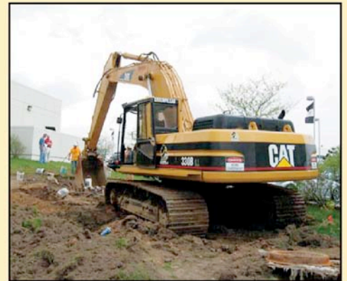
1998 CAT 330BL