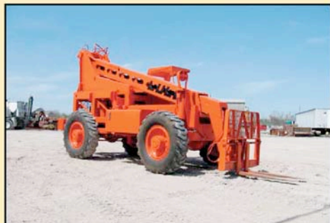
1 of 3 Lull 644TT-34