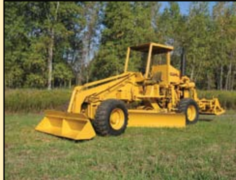
Gehl-Puckett Bros 510D