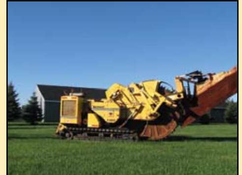
(1 of 3) Vermeer T600 CRC31 Rocksaws