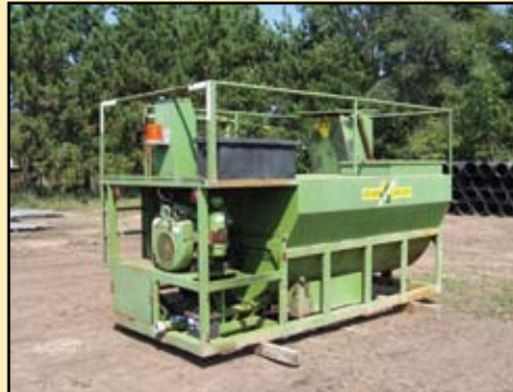
Bowie 1100 Gal.