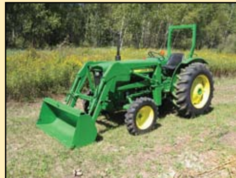
John Deere 1050 4x4

s/n 1B4HS28Z5XF575369, 051407 ODOMETER, c/w V8 5.9L Engine, Auto Trans, Tilt, Cruise, Full Power, FM/AM/CD Stereo, Vinyl Bucket Seats, Trailer Package, 31x10.5R15LT Tires