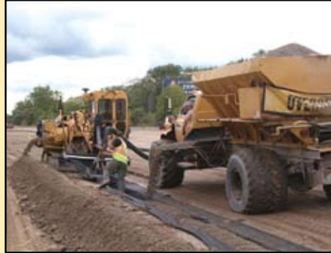
Vermeer T555TR & Spreader Truck at Work