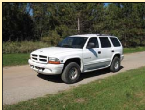
Dodge Durango SLT 4x4