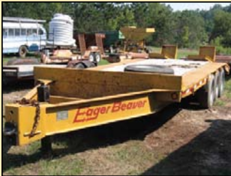
Eager Beaver 10 Ton