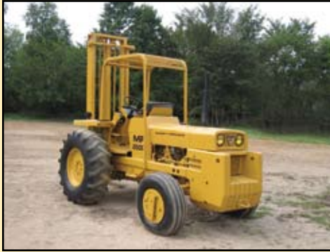
Massey Ferguson 2500