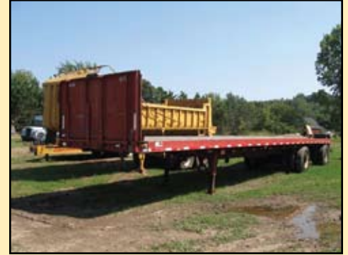
Great Dane 45 ft.