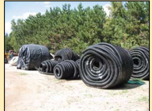
ADS Maxi Rolls