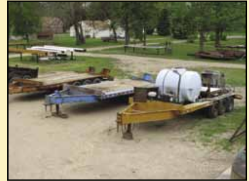
Eager Beaver Equipment Trailers