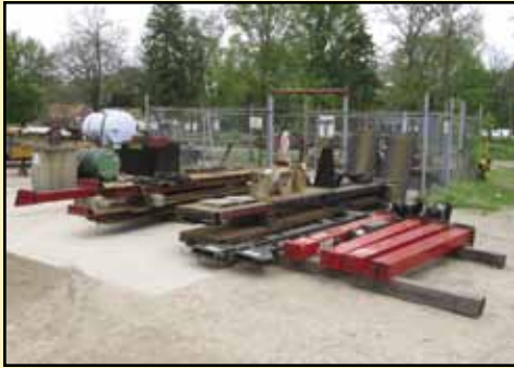
Hunter WA140 & Ammco 4400SL Wheel Alignment Systems