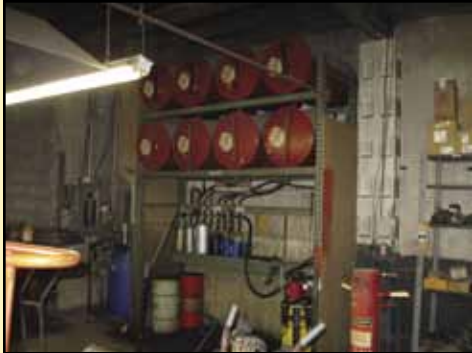
Oil Distribution Center