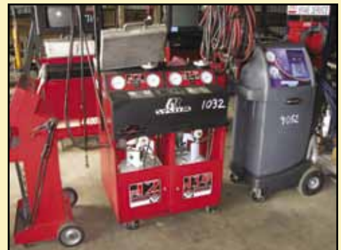
White 1234L Freon AC Cleaning

ASSORTED BROOMS, CHAINS, JUMPER CABLES, COME-A-LONGS, CRAFTSMAN TOOL CHESTS, 1" TO 1/2" IMPACT & STANDARD SOCKETS, OPEN/BOXED END WRENCHES, ALLEN WRENCHES, PALLET PULLERS, HAND TOOLS, SCRAP STEEL, LANDSCAPE H BEAM DRAG, WOOD TIMBERS, (4) MISSION PRODUCTS 4x3 MUD PUMP (2) JOHNSON H110 & HALCO H400 GEAR PUMPS, ASSORTED STEEL PIPE, TRAFFIC CONES, WELDING SUPPLIES, METAL STORAGE RACKS, SPARE ENGINES (PARTS), CRAFTSMAN TOOL BOXES, OLD MACHINIST CHESTS, OFFICE SUPPLIES, HAND SLEDGES/SHOVELS, C-CLAMPS, PIPE WRENCHES, GREASE GUNS, ANVIL, LINCOLN GREASE MACHINES, CASING CAPS, PLUMBING & ELECTRICAL SUPPLIES, JET PUMPS, WELL SEALS, SUBMERSIBLE PUMPS (unused), LADDERS, PVC, BRASS & GALVANIZED PIPE FITTINGS, HAND CARTS, BARREL CARTS, DROP CORDS, PIPE CUTTERS, WATER LEVEL INDICATORS, PAINT SUPPLIES, HAND CRIMPER/ WIRE CUTTERS, CHAIN, CHAIN BINDERS, BOLT/NUT BINS, PARTS BINS, SOCKET HEAD CAP SCREW BOLTS, METAL FILE CABINETS, EQUIPMENT SERVICE MANUALS, STEEL DRILL BITS STRAIGHT & TAPERED SHANK, WORK GLOVES (unused), CLEANING SUPPLIES, O-RINGS, LATHE TOOL BITS, TIRES, SEWER TAPE, HEXCRAFT, TUBE BENDERS, METRIC T-HANDLE KEY SET, OIL CANS, WORK PLATFORM, INDUSTRIAL SHELVING, LOAD BINDERS, CHAINS (some certified), CASING COMPONENTS, BEARING PULLERS, WIRE LOON, SUBMERSIBLE TEST PUMPS