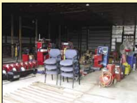
Automotive Service Equipment