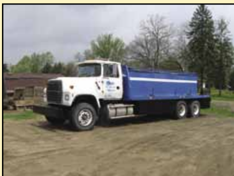
Ford LT9000 Water Truck