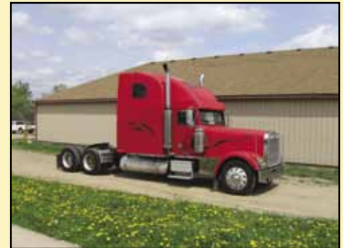
Freightliner FLD132 Classic

EAGER BEAVER 10-TON TRI/A EQUIPMENT TRAILER , S/N OBL (1120BD309CA090134), c/w 8x18 Deck, Manual Load Ramps, Landing Leg, Spring Susp, Electric Brakes, 9.50x16.5 Tires