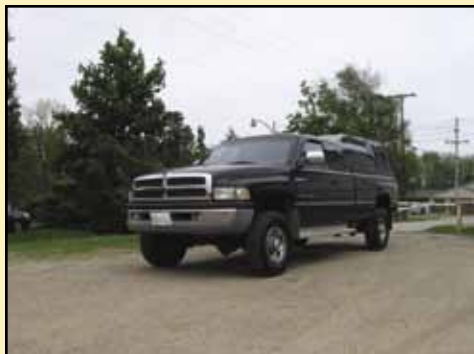
Dodge Ram 2500 4x4