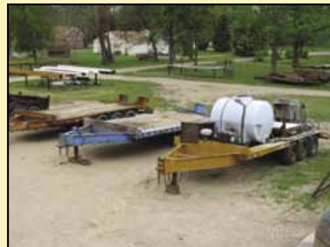
Eager Beaver Equipment Trailers