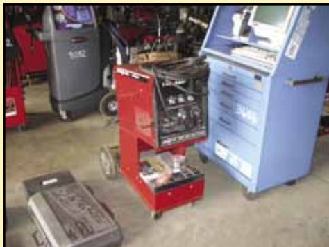
Snap-On YA219C 140 Amp