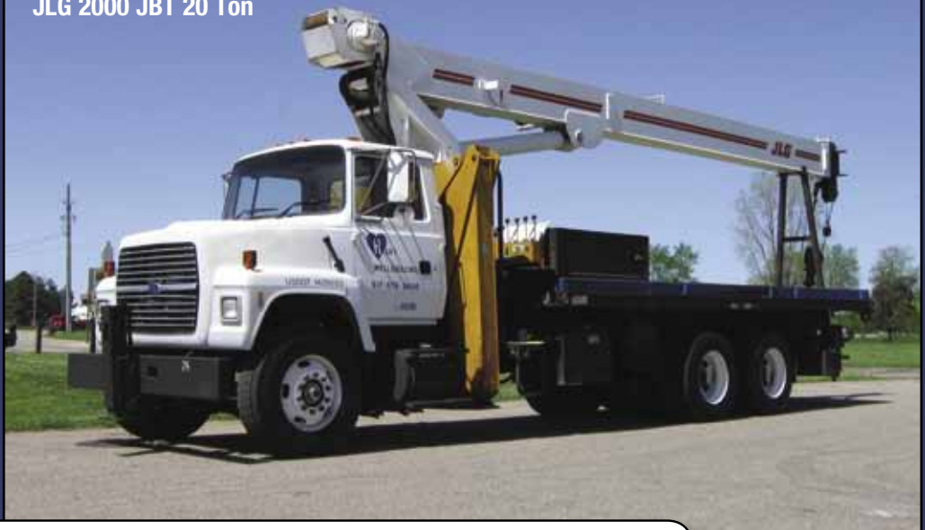
JLG 2000 JBT 20 Ton

This is your opportunity to pick up additional equipment for your operation. If you are looking for water well drilling rigs, flatbed/water trucks, truck tractors, telescopic forklifts, trailers, trenchers, automotive serving tools & equipment, and 100s and 100s of project/hand tools, DON'T MISS THIS SALE.