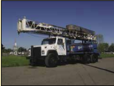
Ingersoll-Rand TH55 Cyclone