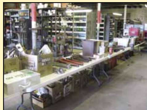
100s of Tools