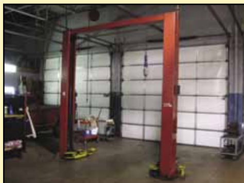
(1 of 4) Vehicle Lifts