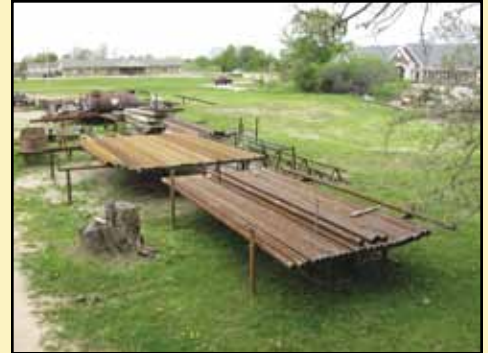
Rotary Drill Rod