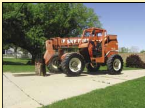
(1 of 2) Skytrak 6036 4x4