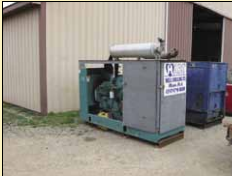
Onan 100KW Gen Set