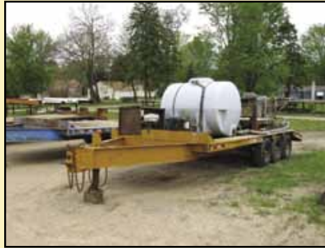
Eager Beaver 12 Ton Grout Trailer