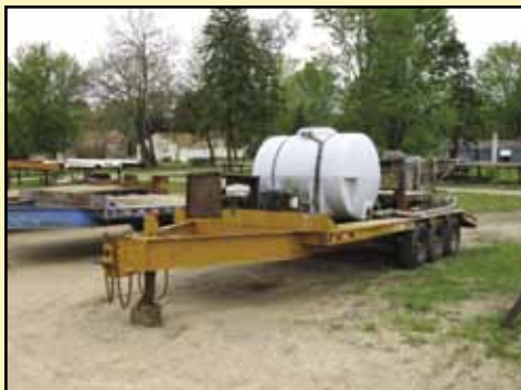
Eager Beaver 12 Ton Grout Trailer