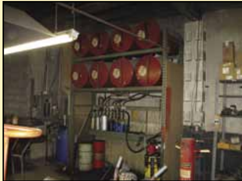
Oil Distribution Center