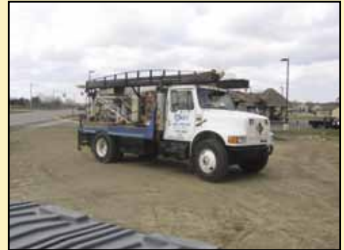
IHC 4900 Pump Hoist