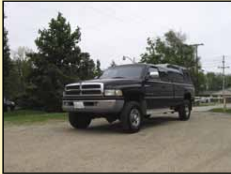
Dodge Ram 2500 4x4