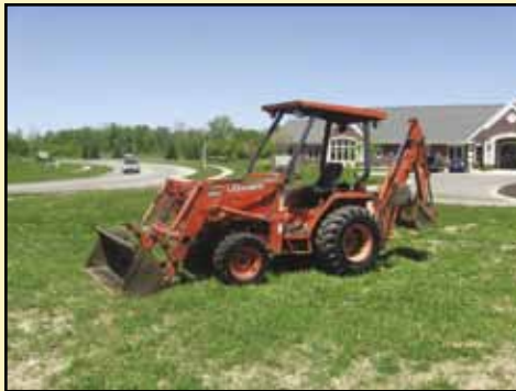
Kubota L35 4x4