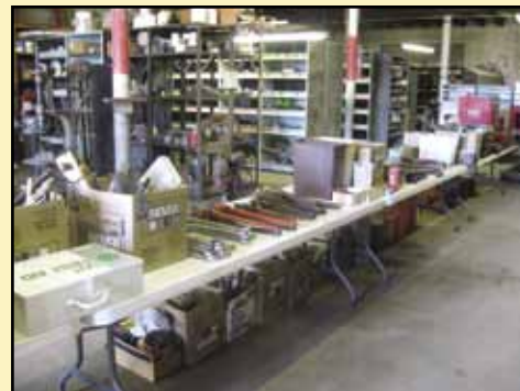
100s of Tools