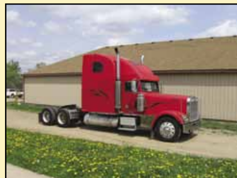
Freightliner FLD132 Classic

EAGER BEAVER 10-TON TRI/A EQUIPMENT TRAILER , S/N OBL (1120BD309CA090134), c/w 8x18 Deck, Manual Load Ramps, Landing Leg, Spring Susp, Electric Brakes, 9.50x16.5 Tires