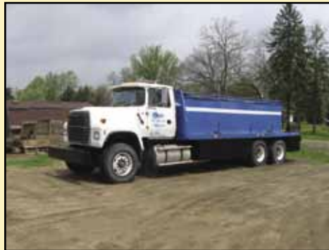
Ford LT9000 Water Truck