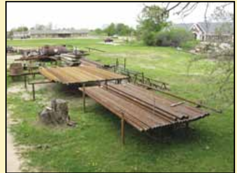
Rotary Drill Rod